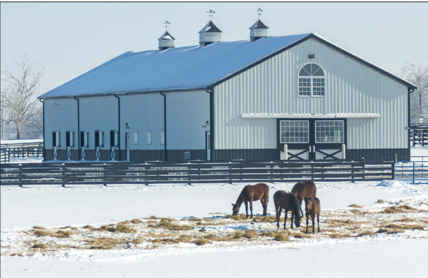
Hay is especially important to horse owners, though finding the best product for the best price can sometimes be difficult.