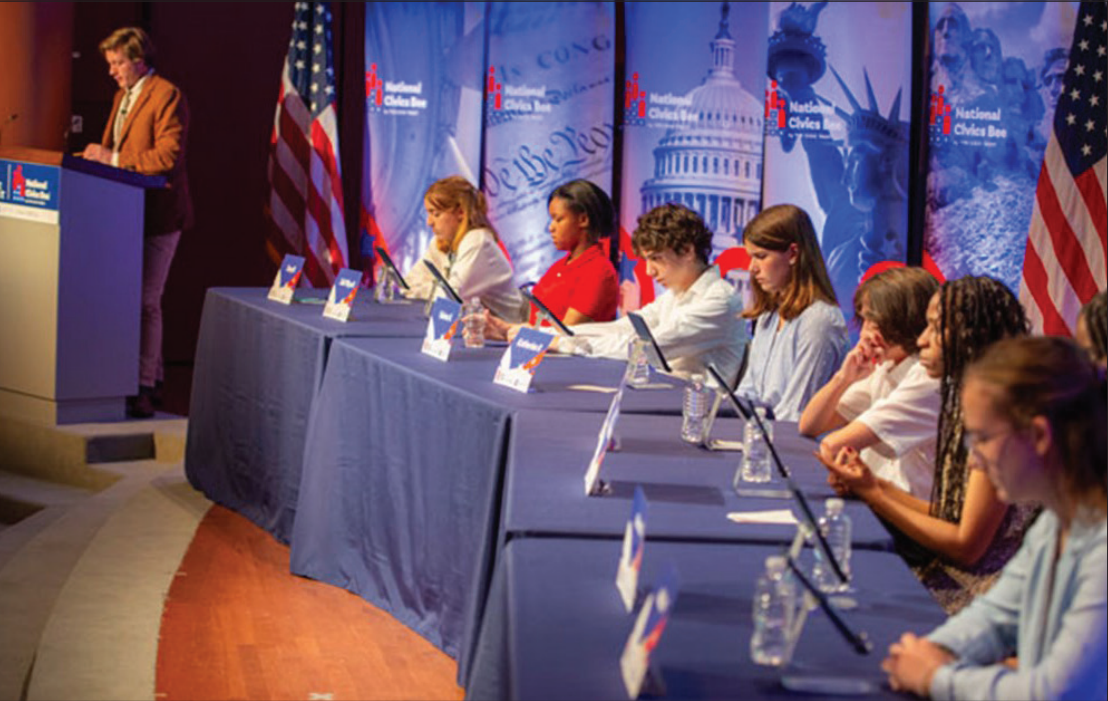
The National Civics Bee® encourages young Americans in 6th, 7th, and 8th grade to engage in civics and contribute to their communities.