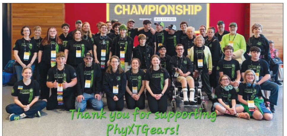
Matthews-area robotics team and its community supporters took a photo in Houston, Texas at the world championships.