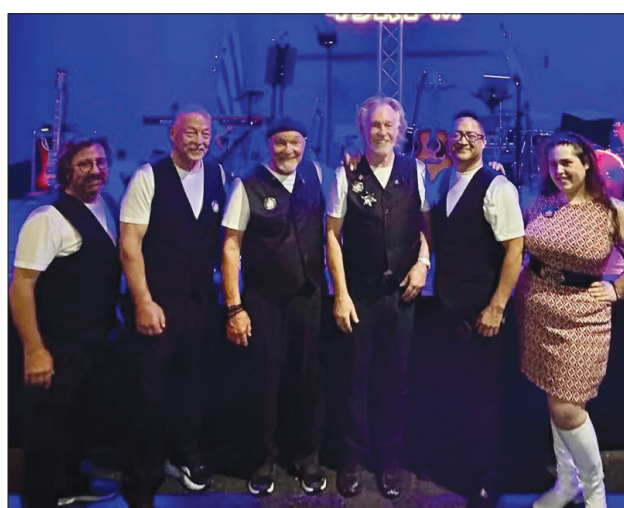
Wednesday, June 10, the band 45RPM took the James Dean Memorial Stage at PlayAcres Park in Fairmount.

Chicago and Milwaukee. Grow with us: www.carthage.edu