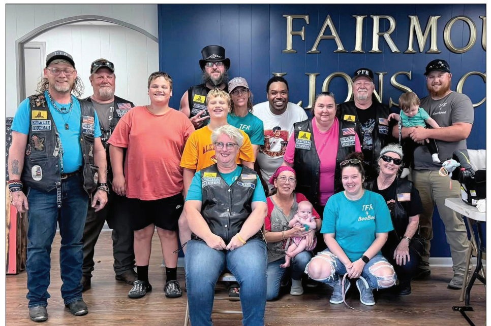
Freedom Riders who attended the veterans event Saturday posed for a group photo.