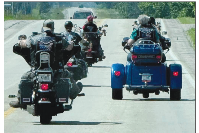
Members of the Freedom Riders travel together on their ride near Fairmount Saturday.

For more information go to Facebook: The Freedom Riders IN Ch 4