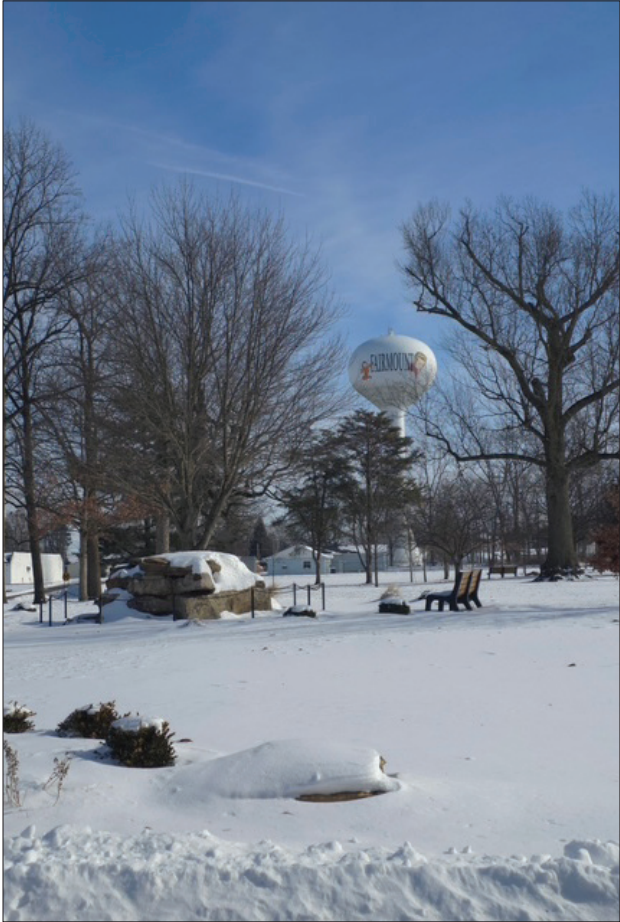
Snow in Fairmount by Cathy Shouse