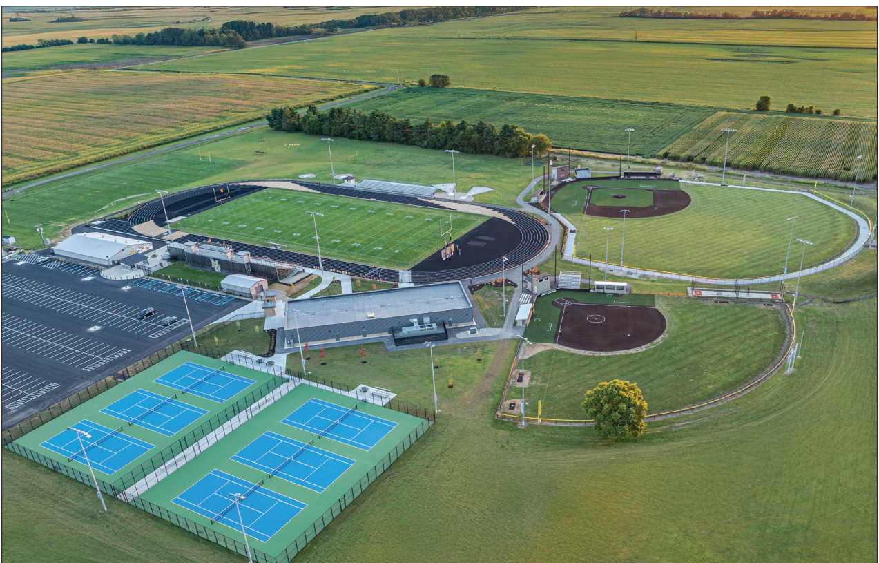
Madison-Grant Outdoor Sports Complex